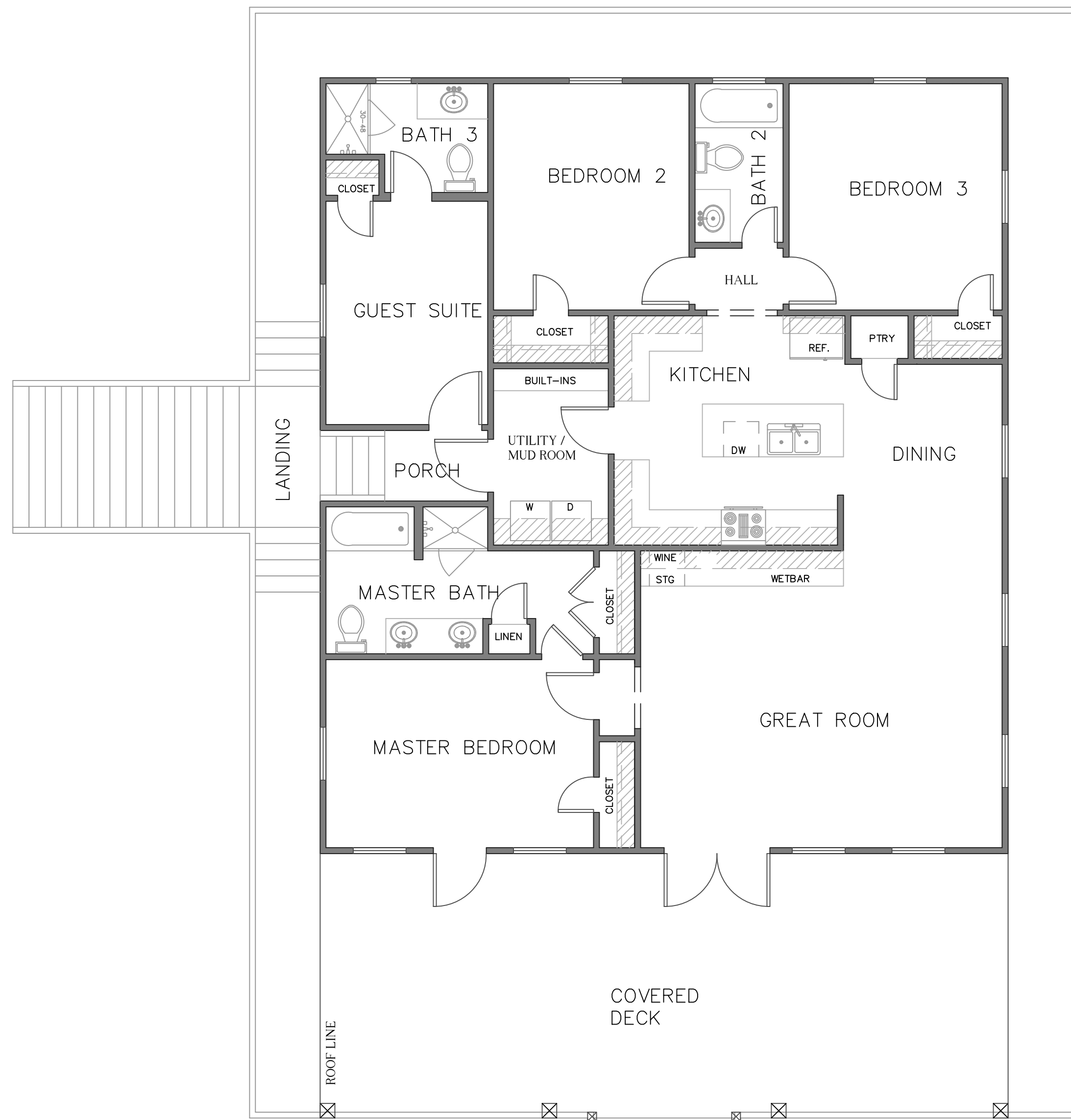
1ST LEVEL PLAN

AREA LIVING— 1716 SQ FT DECK— 3098 SQ FT STORAGE— 590 SQ FT ENCLOSED— 384 SQ FT WIDTH: 39' DEPTH: 44' (EXCLUDING DECK)