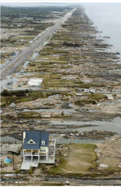
A single house is left standing amidst the devastation left by Hurricane Ike in Gilchrist, Texas.